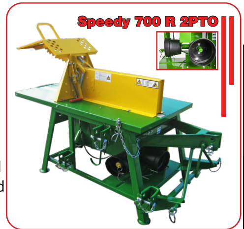
Speedy 700 R 2PTO

Compared with traditional saw benches, Speedy allows cutting not only defined shape logs, but also irregular shape logs and bundles of branches. This saw bench is completely built in Italy with very high quality materials in order to produce a long-lasting machine.